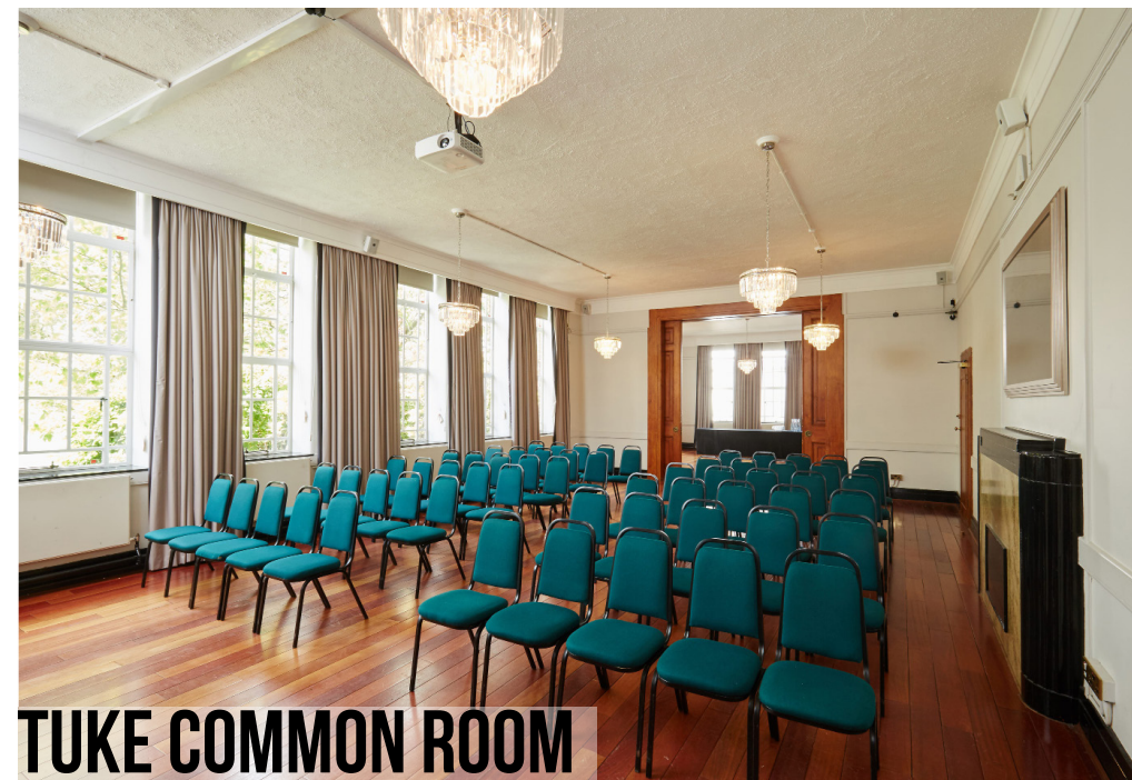
TUKE COMMON ROOM