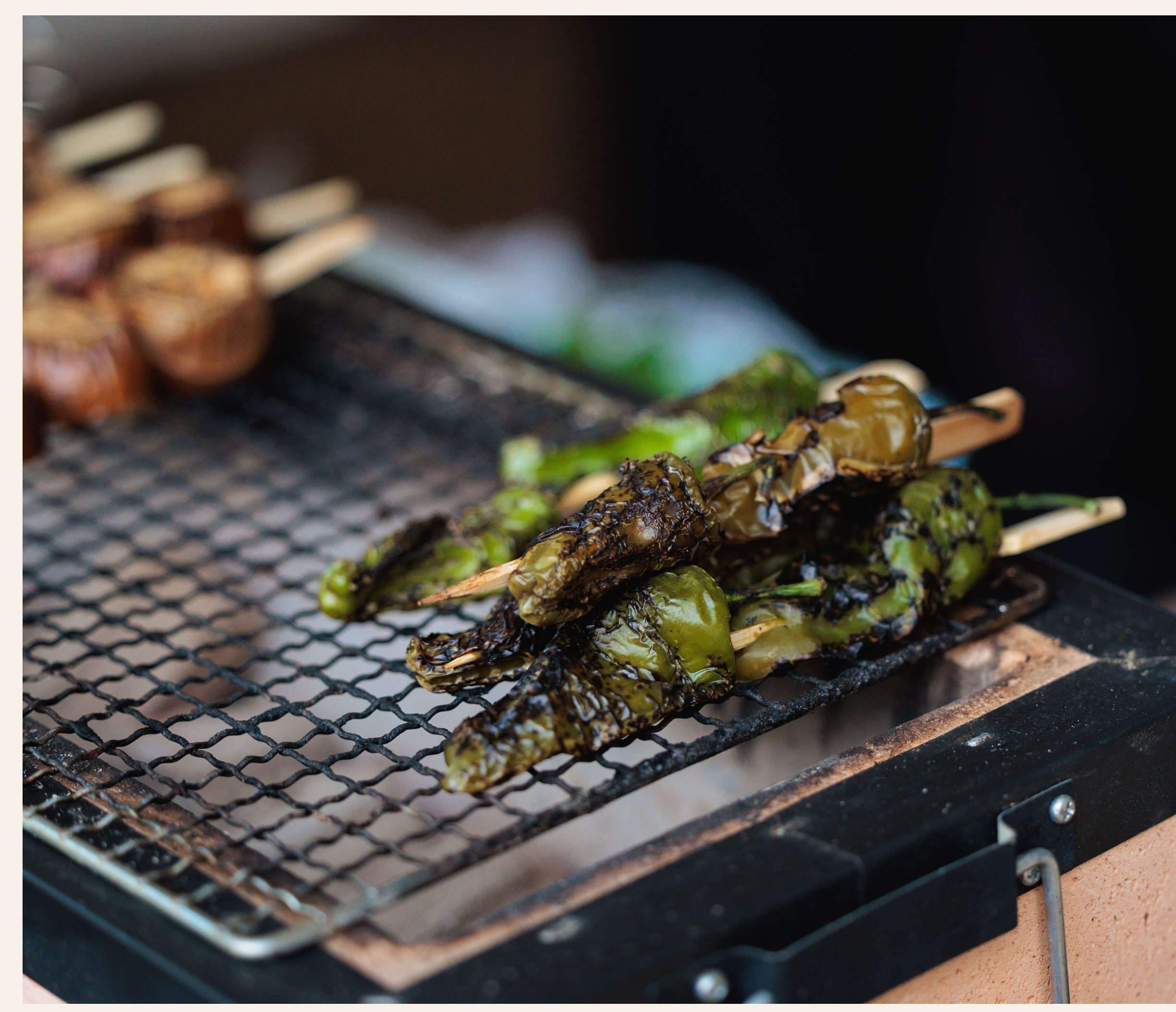
Unless otherwise selected, plant based/vegetarian food will be provided for 20% of your guests . Main dietary abbreviation symbols: (VG) vegan, (V) vegetarian, (GF) gluten free.

Sauces and Toppings Kombu tare sauce Green onion Furikake Shichimi Yuzu salt Nori salt