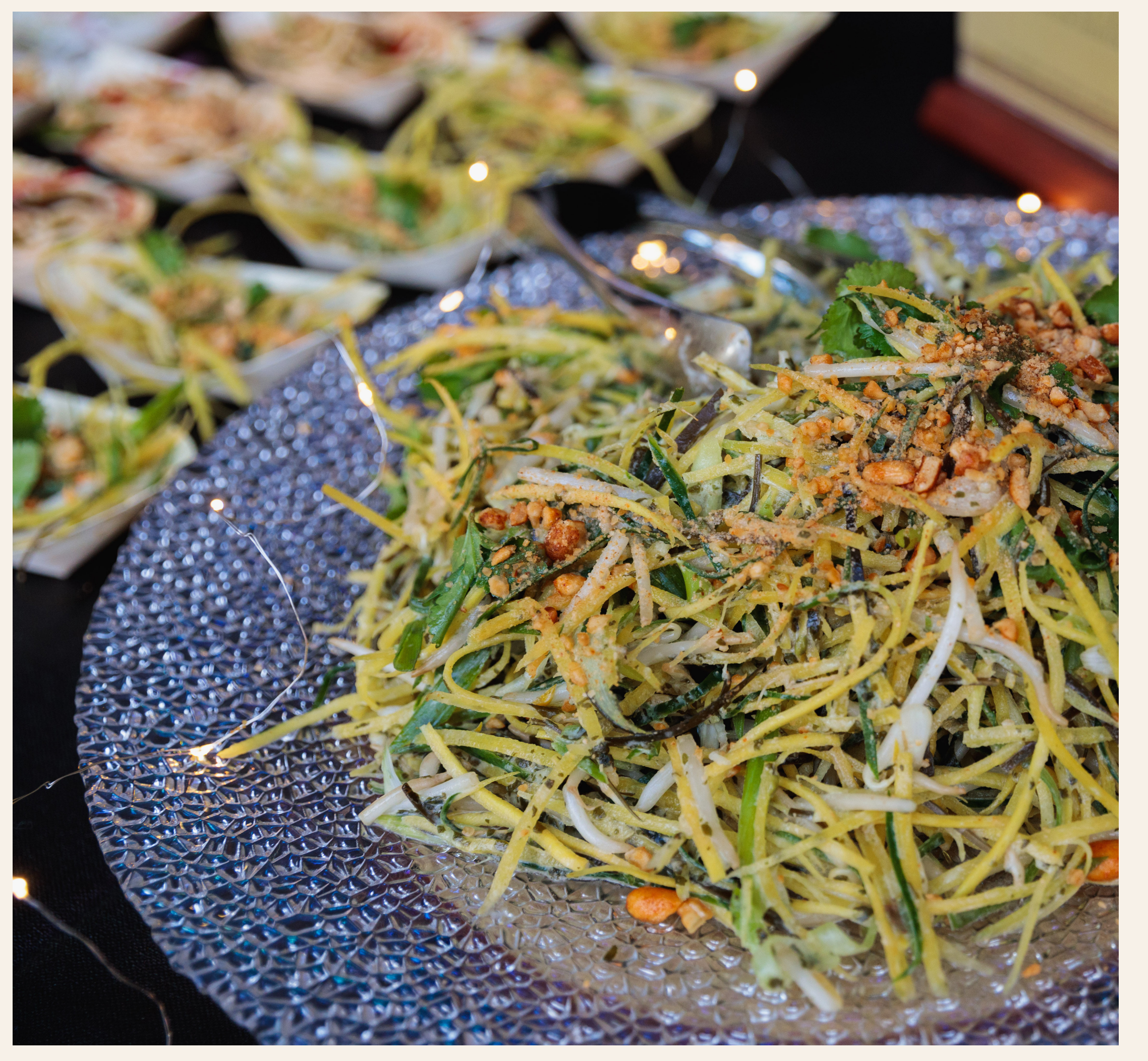
Unless otherwise selected, plant based/vegetarian food will be provided for 20% of your guests . Main dietary abbreviation symbols: (VG) vegan, (V) vegetarian, (GF) gluten free.

Taiwanese cold eggplant salad (vg) Smashed cucumbers (vg) Oriental salad (vg)